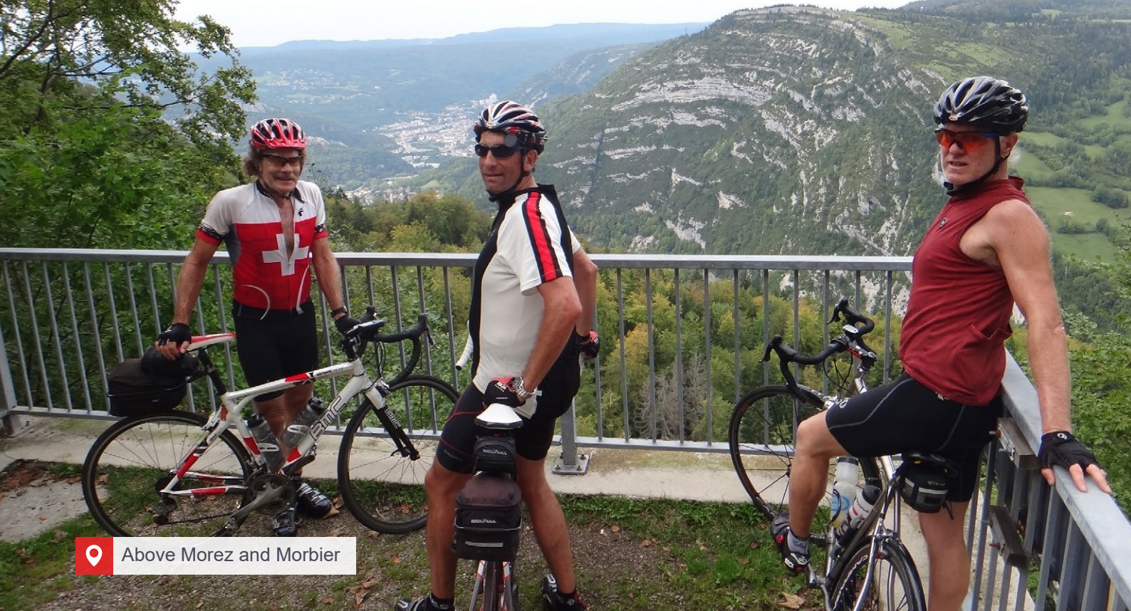
📍 Above Morez and Morbier

These long, twisting roads will eventually take us to a large isolated auberge in the middle of nowhere. I found this place quite by accident at the end of a long day of riding many years ago. I haven't been back since. I've tried several times, but the French do enjoy closing and leaving for holiday at the most inconvenient moments. I do remember that the cuisine was tasty and hearty and that they sold wonderful regional "Jurassic" beer. Let me know if things have changed.