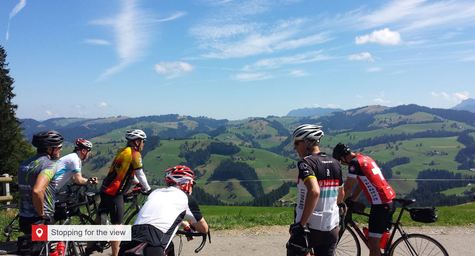
📍 Stopping for the view

Consider taking lunch in Schangnau, before passing into a UNESCO biosphere reserve. The designation confirms what you might suspect: you're in a region whose cultural and natural landscape has changed little over the centuries. The locals voted to become a reserve years ago and have made a commitment to promoting their own regional products, cultivating the natural resources (grass, wood, landscape) and developing ecotourism.